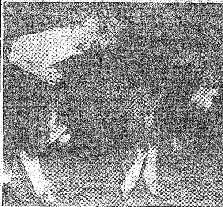
It really will be hard to tell Monday night, whether the donkeys, the players or the spectators get the biggest laughs when the Texas Ranger Donkey Club plays here with local players such as this one astride. The game will start at 8 p. m. at the Athletic Field.