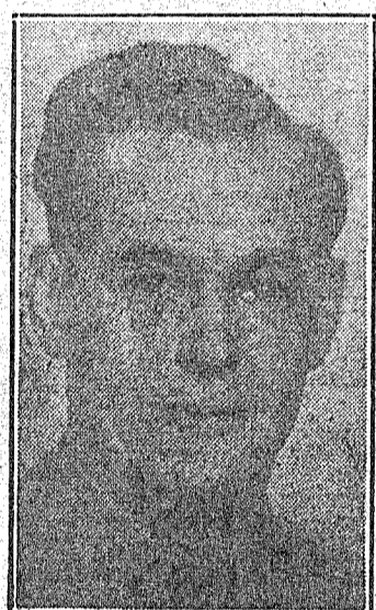
THEIR NEIGHBORS SHOULD KNOW!