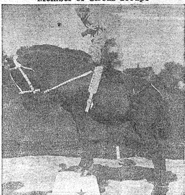
Proceeds from the Bible's Annual Circus will buy Ward School equipment. The show is tonight at the high school at 7:30.

and vegetable salads, hot rolls, whipped cream, pecan pie and coffee.