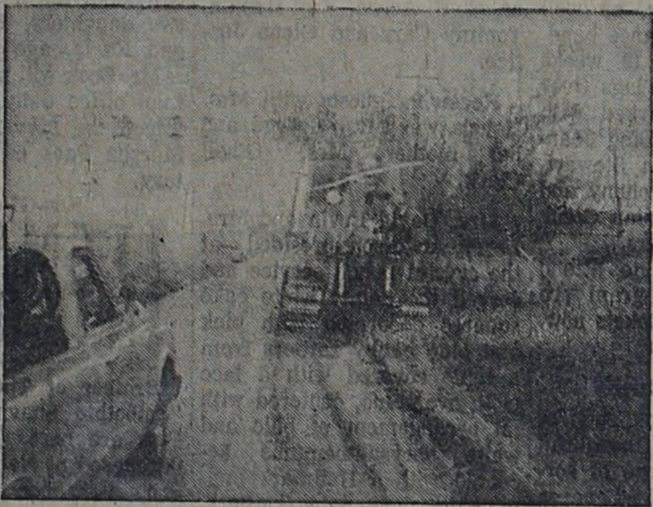
THESE SCENES ILLUSTRATE THE CABLE LAYING CONSTRUCTION NOW IN PROGRESS IN THE RURAL GORMAN AREA