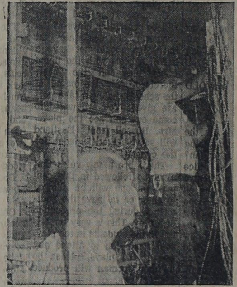
SWITCHBOARD INSTALLATION NOW IN PROGRESS IN GORMAN EXCHANGE