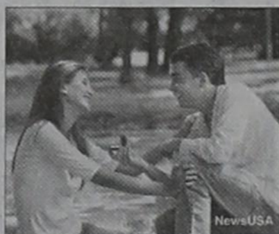
Choosing the right engagement ring can help make your big moment memorable.

(NU) - An engagement ring symbolizes your promise to love and cherish your partner forever, and shows the world your commitment to your fiancée. Many women dream about their engagement ring their entire lives, so choosing the right style is of utmost importance.