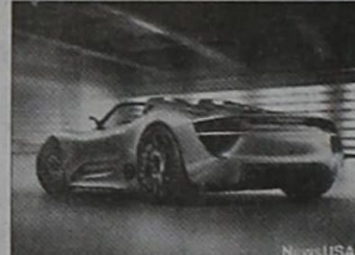
Hybrid cars can hold their own on the racetrack.

(NU) - When most people think of hybrid cars, they imagine practical, mild-mannered vehicles. But could we someday see hybrid racecars burning up the tracks?