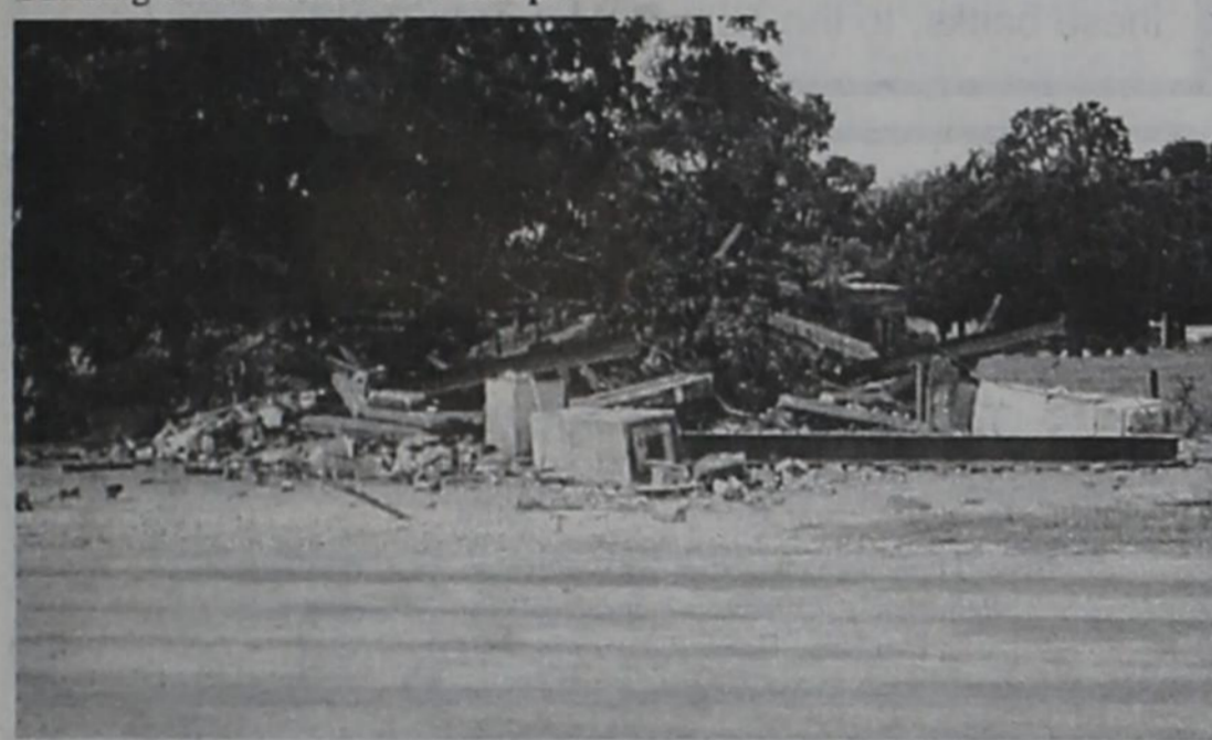
LANDMARK COMES DOWN — The old Gulf Station at the corner of Kent and Ross Streets, a landmark in Gorman, has been torn down and removed the clear the lot in preparation for the Peanut Festival activities, slated for September 10th. Plans are underway for a carnival to be placed on the empty lots where the old station, welding shop and gin once stood.