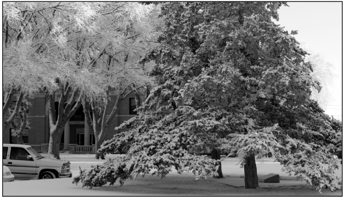
Snow falls About 2 to 3 inches of snow fell on the area last week, causing late school openings and power outages. But the icy tree branches sure looked pretty.

Sponsored by the Farwell Banking Center Muleshoe State Bank