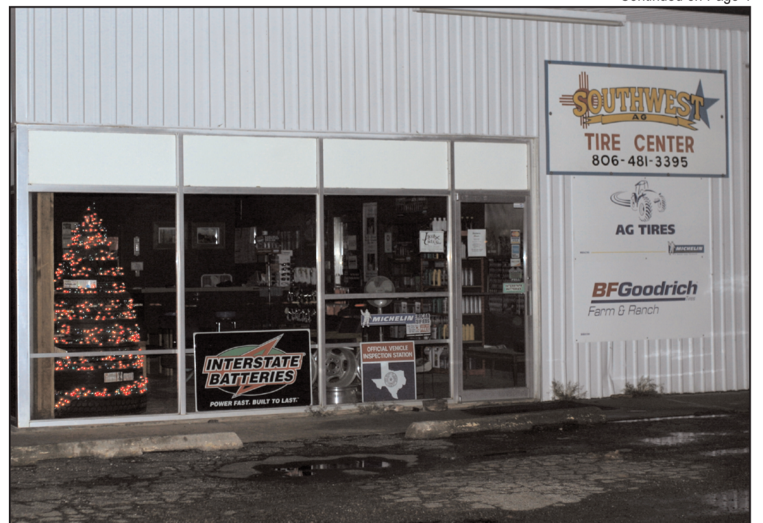
Southwest Ag Tire Center made their Christmas tree out of tires this year.