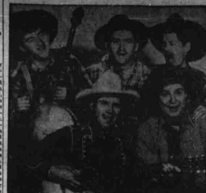
Gene Autry and his band of musicians bring melody, as well as comedy and action, to the Lyric screen Friday and Saturday in Gene's newest starring picture, "The Old Barn Dance." Here're the boys all tuned up and ready to deliver a breakdown.