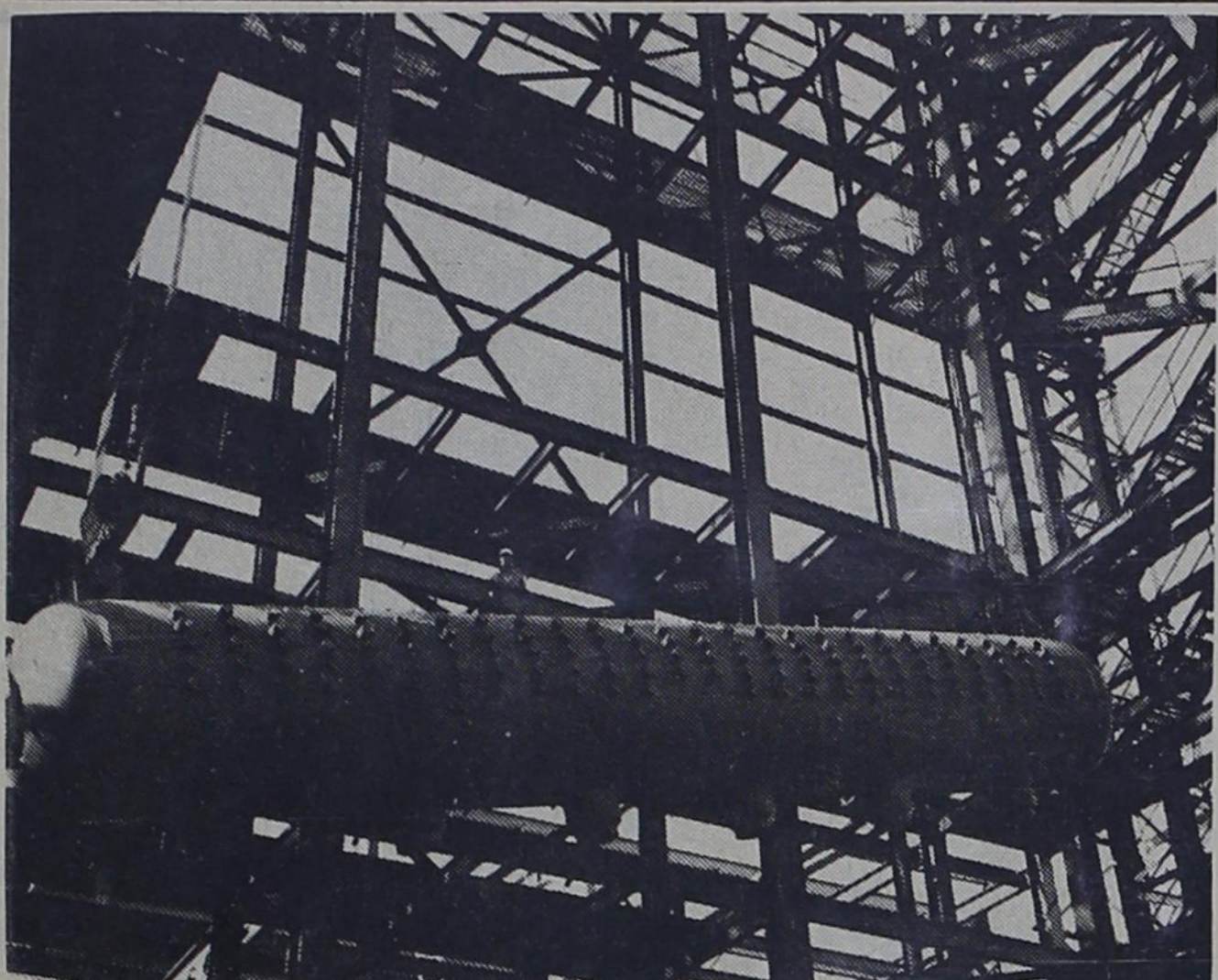
Continued construction on a 210,000 kilowatt generator at Nichols Station, northeast of Amarillo, is part of Southwestern Public Service Company's $20,000,000 improvement program for 1967. Pictured is the installation of a 225,000 pound boiler drum for the new generating unit.