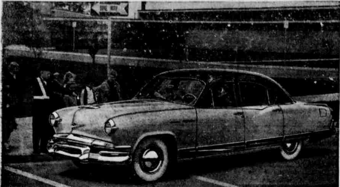
MORE HORSEPOWER under the hood and new chrome trim which accents sweeping body lines are features of the Kaiser for 1953. Described as the world's first "safety first" automobile, all of the new Kaiser models are equipped with richly cushioned safety dash panels which harmonize with exclusive vinyl and fabric upholstery combinations. Horsepower of the 1953 series, offered with optional overdrive or Hydra-Matic, has been increased without affecting economy of operation.