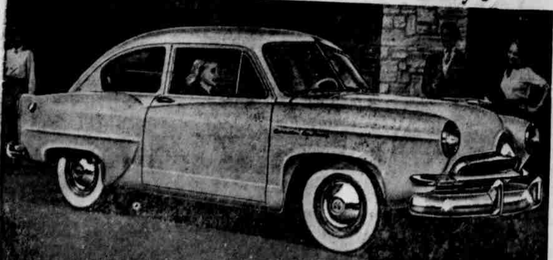
GREATER IN LENGTH and featuring completely restyled interiors, the Henry J for 1953 continues to offer the high performance and fuel economy characteristics which won the 1952 Mobilgas Economy medals. An instrument panel safety crash pad is one of 40 new features in the low-priced Henry J models. Both offering high power-to-weight ratios, the four-cylinder Corsair delivers 68 horsepower and the six-cylinder Corsair Deluxe, 80 horsepower.