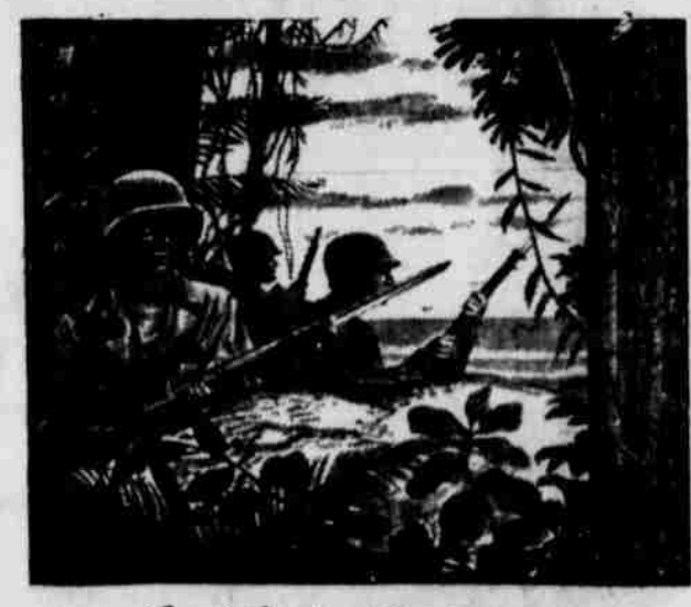
South Pacific - Christmas, 1943