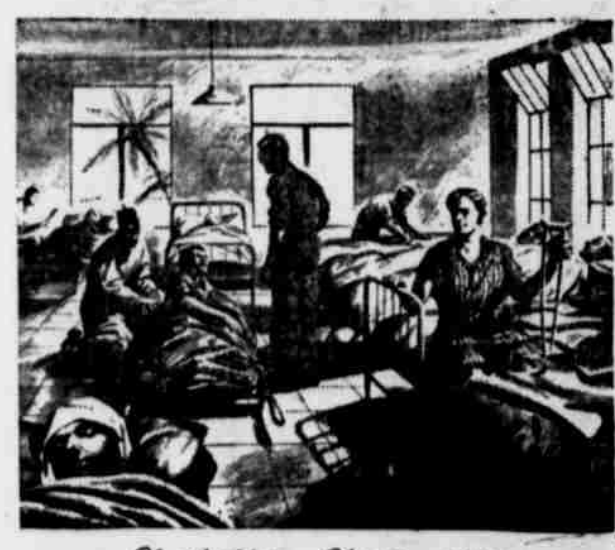
North Ofrica-Christmas, 1943