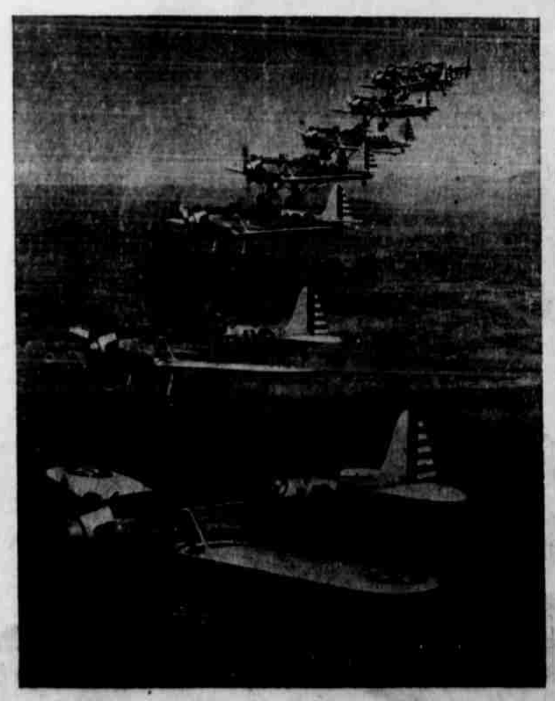
Flashes of "lightning" in the sky. At the controls of these P-38 Lightning interceptor-pursuits are Army Air Force pilots. Heralded as the world's fastest airplanes, the Lightning's power is furnished by twin Allison engines.