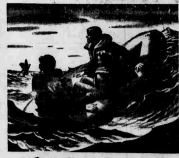
English Channel-Christmas, 1943

THIS YEAR, when you wish everybody Merry Christmas, think of the millions of American boys who aren't having such a merry time.