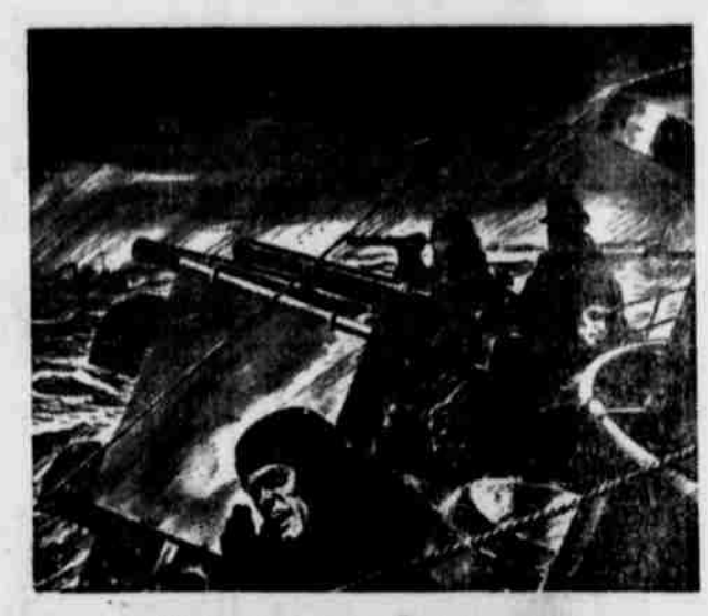
North Atlantic-Christmas, 1913.