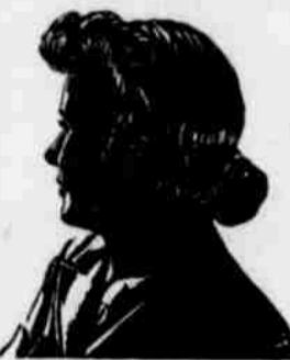
COPYRIGHT 1944, CLAIROL, INC.