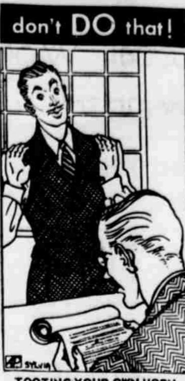
TOOTING YOUR OWN HORN ... If you are too loud in your own praise, the effect may be just the opposite of what you might expect.