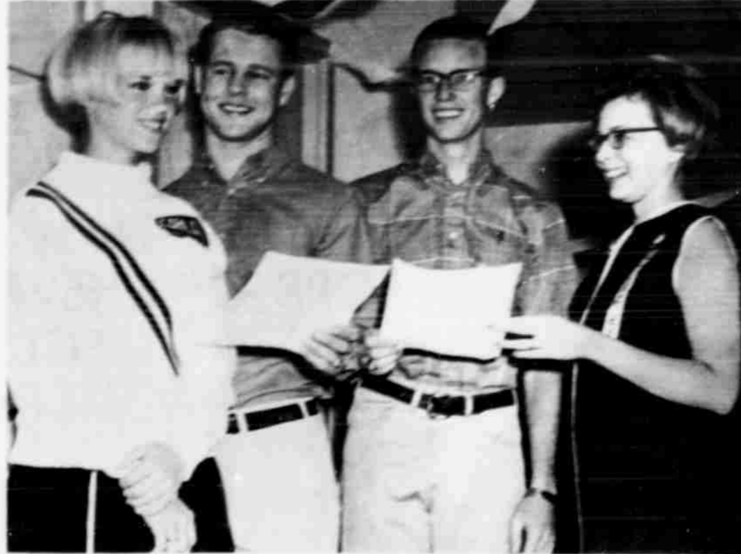
VICTORY SONG - "V is for victory, F is for fight . . ." This is the beginning of the words which may become the official words for our Littlefield High School fight song, "Victory." The inspiration for these words came to three of our high school students