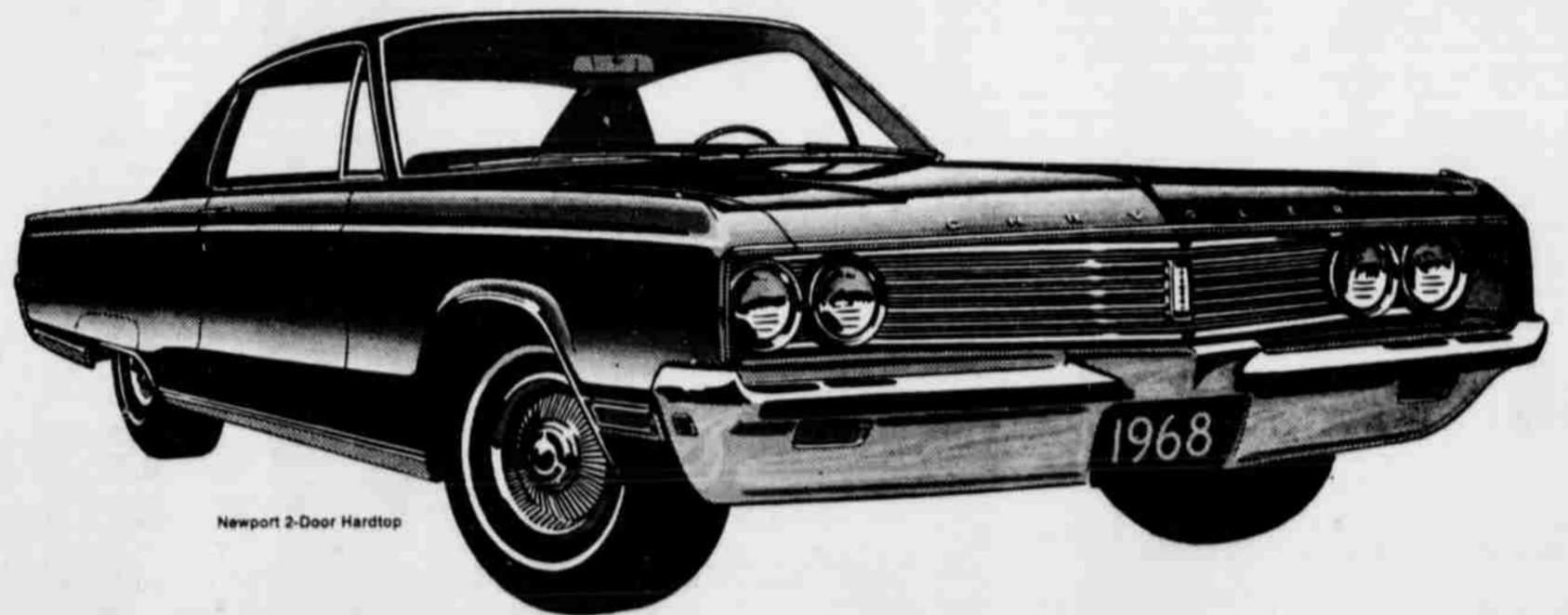
Newport 2-Door Hardtop

Here's news for the big-car man! Now four 1968 Chrysler Newports are priced just a few dollars a month more than the most popular smaller cars, comparably equipped. That means with power steering, power brakes, radio and heater. Isn't it time you made your move—up to a big 1968 Chrysler?