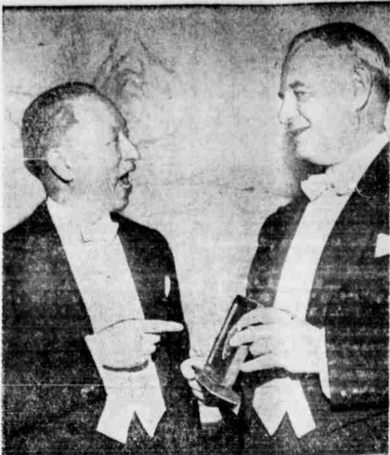
"I GOT ONE FOR" . . . Dr. Wellington Koo (left), Chinese ambassador to the United States, tells Maj. Gen. William J. Donovan, wartime O.S.S. head, that he received the Alexander Hamilton medal last year. Donovan received the medal this year. It is presented to a Columbia university alumnus each year for distinguished public service.