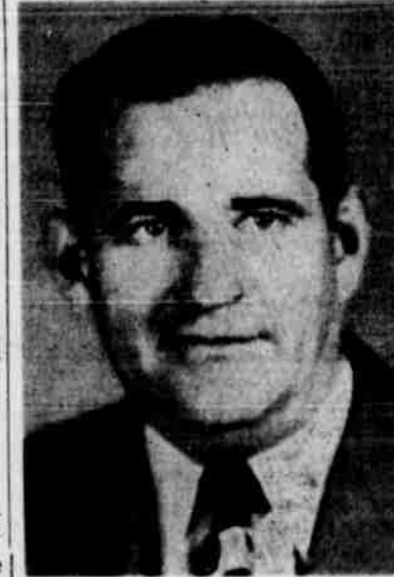
Judge Otha Dent

Judge Otha Dent of Lamb County addressed the meeting of the Lubbock County Rural Roads association in the District Court room at Lubbock Friday night, discussing ways and means of providing revenue to build rural roads.