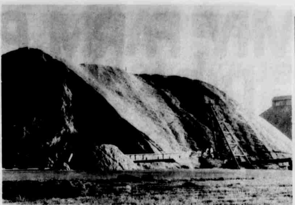
COTTONSEED MOUNTAIN --This huge mountain of cottonseed is an eye-catching scene in Littlefield, and can be seen by passing motorists at Paymaster Oil Mill Co. The pile of seed, towering high as a nearby building, is moved into seed houses by a large conveyor, which can be seen in the photo.

1953 Ford, 1952 Chevrolet pickup for sale, not much car--not much price. 385-3863, Reed Yandell, TF-Y