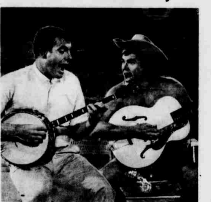
On a spreeing weekend in Palm Springs anything can happen, and does, as in this scene from "Palm Springs Weekend" where Jerry Van Dyke, starred as a goofy ball team manager, and Ty Hardin, as a Hollywood stuntman, get together to out-sing each other. "Palm Spring Weekend", Warner Bros. comedy in Technicolor, opens Sunday at the Palace Theatre. Along with Tardin and Van Dyke, the picture stars Connie Stevens, Troy Donahue, Stefanie Powers, Andrew Duggan, Carole Cook, Robert Conrad and Jack Weston.