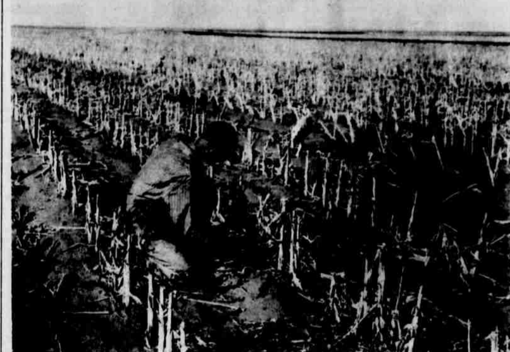
CONSERVATION PRACTICES--A combination of crop residue and listing to control water erosion and to conserve rainfall is used on the W.H. Cunningham farm, located 1 mile west and 1 mile south of Littlefield. In the bottom photo, Dennis Hoelscher, who farms near Pep, checks sorghum stubble planted 40 inches apart. It provides excellent wind erosion control.