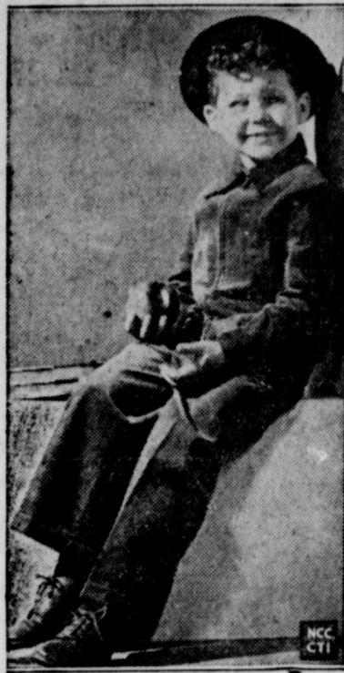
Teacher's best beau keeps warm in cotton corduroy as he waits for the school doors to open. Combinations of long trousers with matching or contrasting jackets rate first place with youngsters because they keep out cold winds, and with mothers because they're so easy to care for.