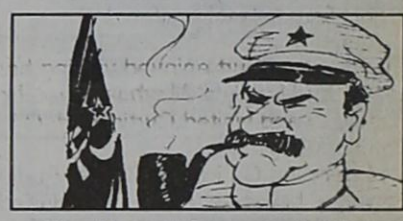
The United States established diplomatic relations with what was then the U.S.S.R. in 1933.