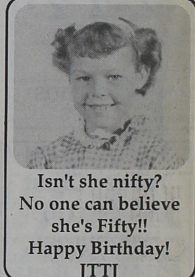
Isn't she nifty? No one can believe she's Fifty!! Happy Birthday! JTTJ