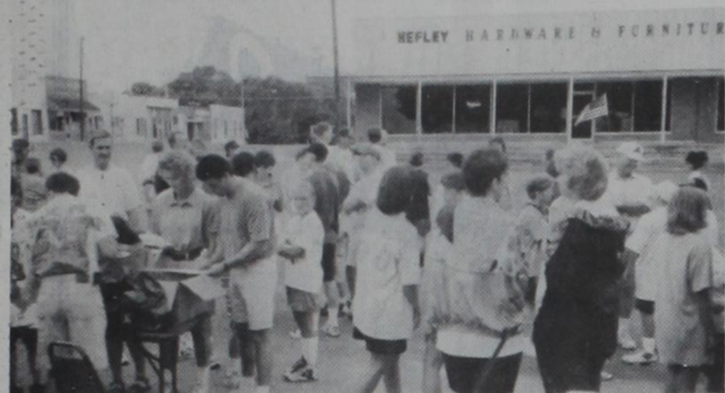
GETTING SIGNED UP: A large crowd was in attendance at the Fun Run/Walk Friday morning. This picture shows only a portion of the participants in the annual event.