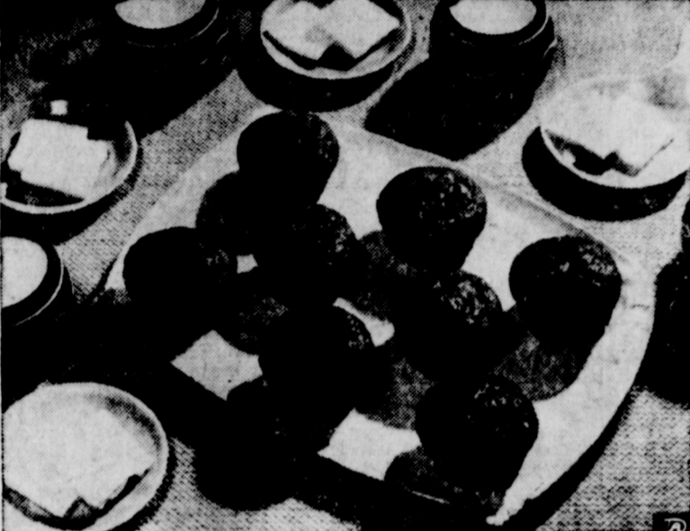
An old-time favorite, molasses, flavors these puffs which may be served either as a sweet bread or simple dessert.

Molasses-sweetened breads and cookies never fail to please today, just as they did in grandmother's time. Here molasses gives its dark tang to a muffin-type bread which is quick to prepare.