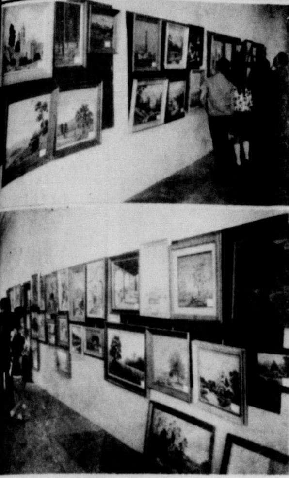
ART EXHIBIT: Shown above are just a few of the 85 paintings by Wheeler County artists which were displayed Friday, April 25. Most people who viewed the paintings could not believe Wheeler County had so much talent. The County Home Demonstration Council is to be commended for an excellent art exhibit.