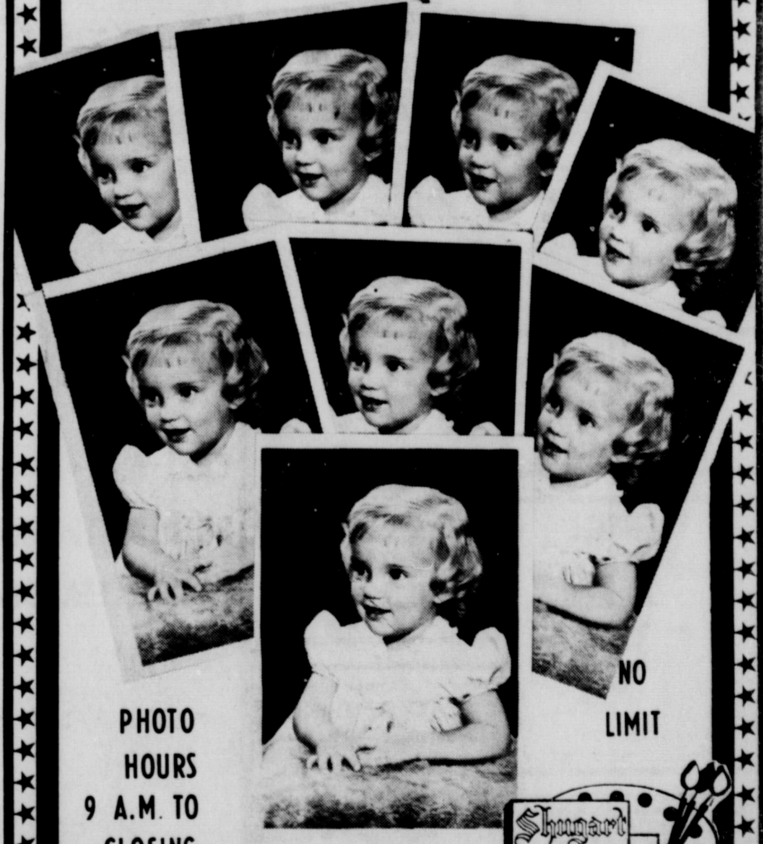
PHOTO HOURS 9 A.M. TO CLOSING

8 99¢ KING SIZE CREATIVE COLOR PORTRAITS FOR ONLY