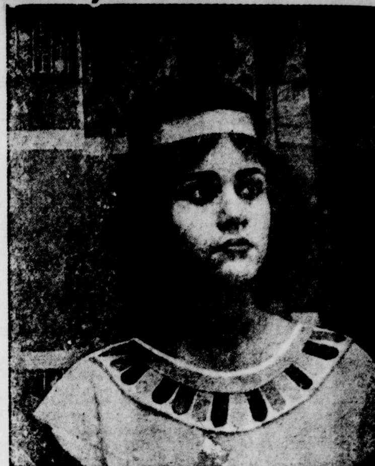
In search of a "fresh" fashion note, young ladies of the modern world are now striving to emulate the queens of Ancient Egypt. The last word in fashions actually first appeared in the courts of Egypt's immortal pharaohs more than 3,000 years ago.