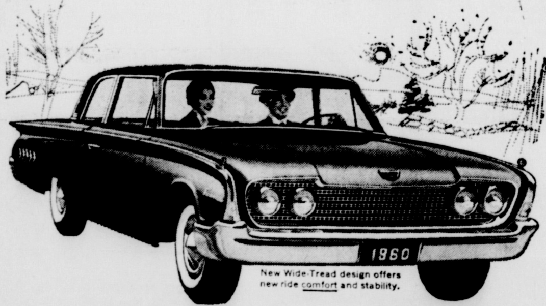
New Wide-Tread design offers new ride comfort and stability.

Come in and see our Value Leader, the Ford Fairlane 500. You won't find more beautiful proportions than Ford's in any car! Extras? You get 'em at no extra cost! For instance . . . two rear seat arm rests, two sun visors, extra ash tray and foam-padded seats. You'll agree you can't buy better at twice the price!