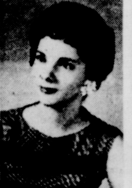
Honorable Mention GILL