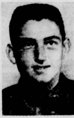
All District LANCASTER