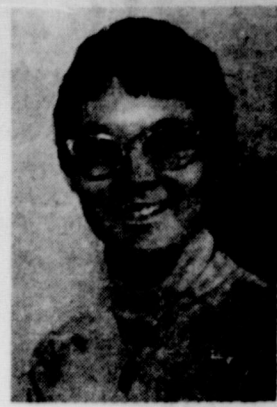
All District Guard