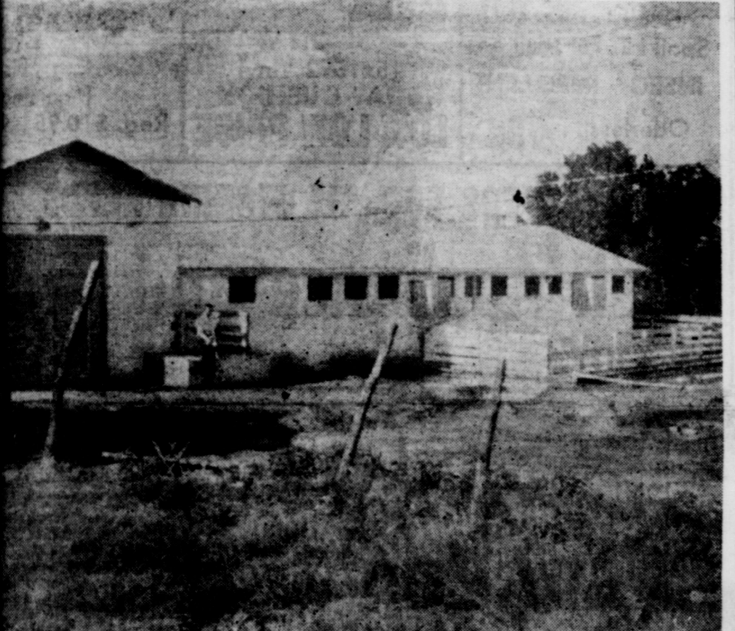
FOR BUSINESS: William Lasater, young Wheeler County farmer, stands be- fore two new buildings just erected on his place northeast of Twitty for the ex- pose of raising hogs for the market. This building contains the farrowing usery, feed mixing room, shower room and hospital.