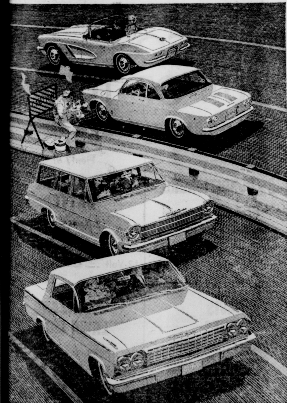
Our Sun 'n' Fun ways to get away (shown top to bottom) are the Corvair, Corvair Monza Coupe, Chevy II Nova Station Wagon and Chevrolet Impala Sport Sedan.

beautiful buying days at your local authorized Chevrolet dealer's Golden Sales Jubilee! ARE CHEVROLET CO. 3101 WHEELER, TEXAS