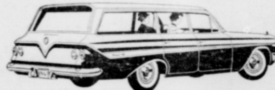
Nomad 9-Passenger Station Wagon. Chevrolet's full-sized wagon more people are picking. A choice of six to save on from nifty Nomads to thrifty Brookwoods.