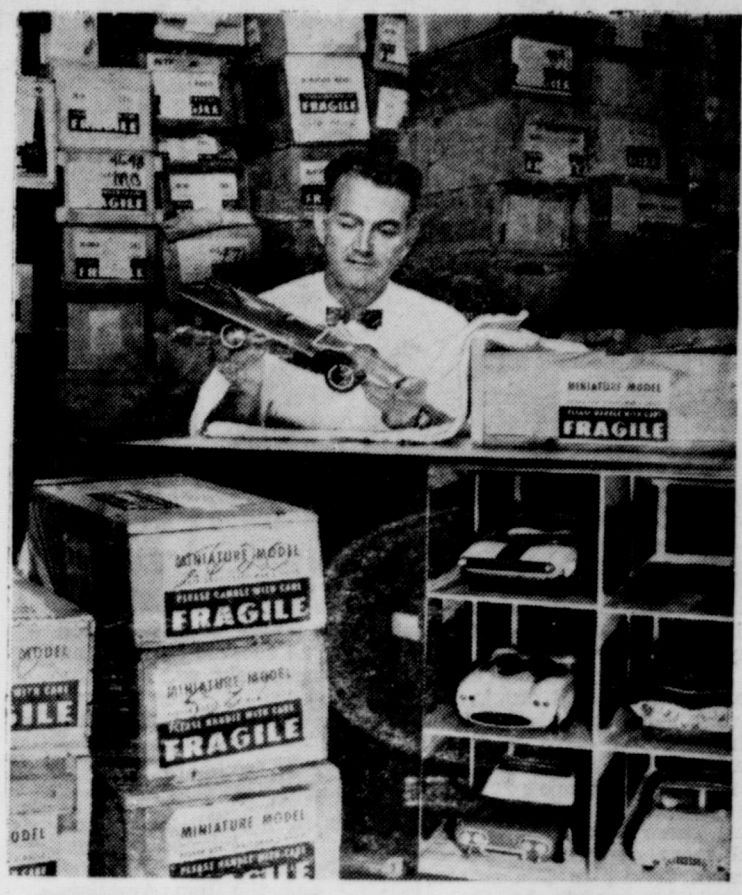
BEGINNING THE COUNTDOWN . . . Hundreds of miniature automobiles, designed and crafted by 11 through 20 year-old boys from all over the United States, await unpacking as the Fisher Body Craftsman's Guild prepares to select the winners of its 1961 model car competition. The judges' decisions will convey $117,000 in university scholarships and cash awards to these talented, teen-age designers.