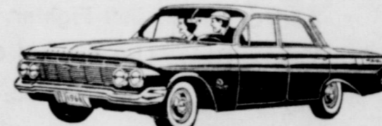
Bel Air 4-Door Sedan. Priced just above the thrickest full-sized Chevroleto. Bel Airs give you the full treatment of Body by Fisher craftsmanship.