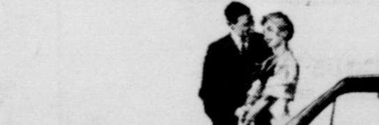
Impala 2-Door Sedan. Like all Chevrolets, this Impala gentles rough roads (or any other kind) with Jet-smooth magic.

See the new Chevrolets at your local authorized Chevrolet dealer's One-Stop Shopping Center