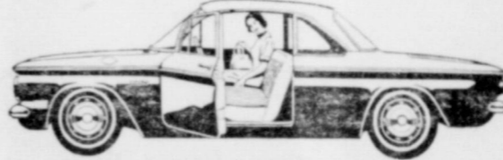
Corvair 700 Club Coupe. A 2-door budget-minded beauty with thistle-down handling, rear-engine traction and quick-stepping, sassy performance.

Ask your dealer about a real cool extra-cost option—Chevrolet air conditioning.