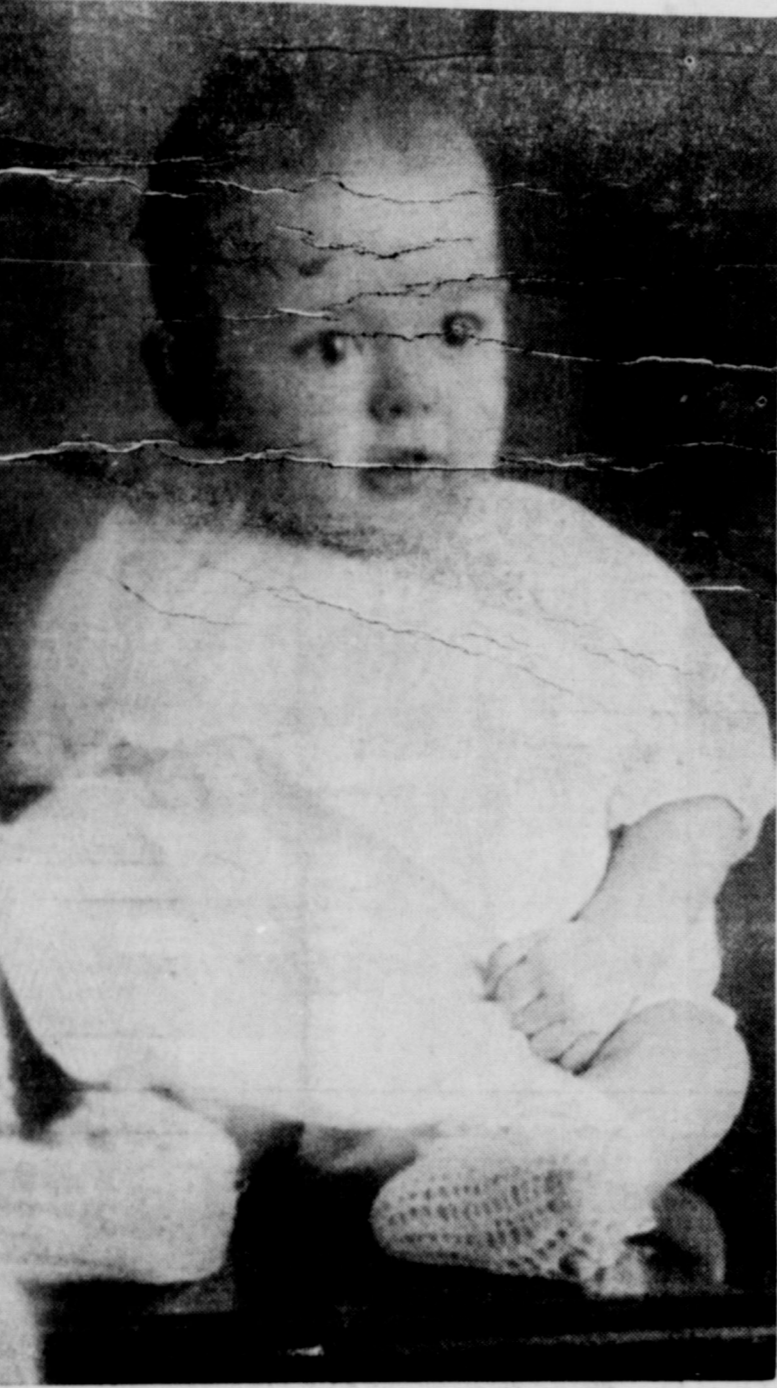
WHO-ZIT: This little fellow grew up in Wheeler County and is quite well known. He is friendly and quiet and one of the most colorful ranchers of the day.