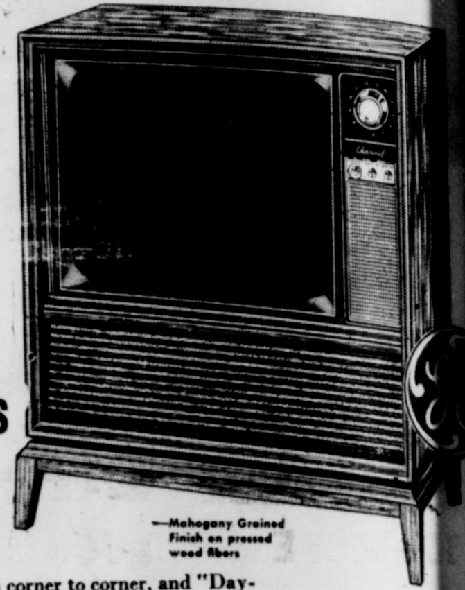
—Mahogany Grained Finish on pressed wood fibers

SAVE NOW ON G-E's FINEST TV SPECIAL PRICES ON ALL 1963 MERCHANDISE