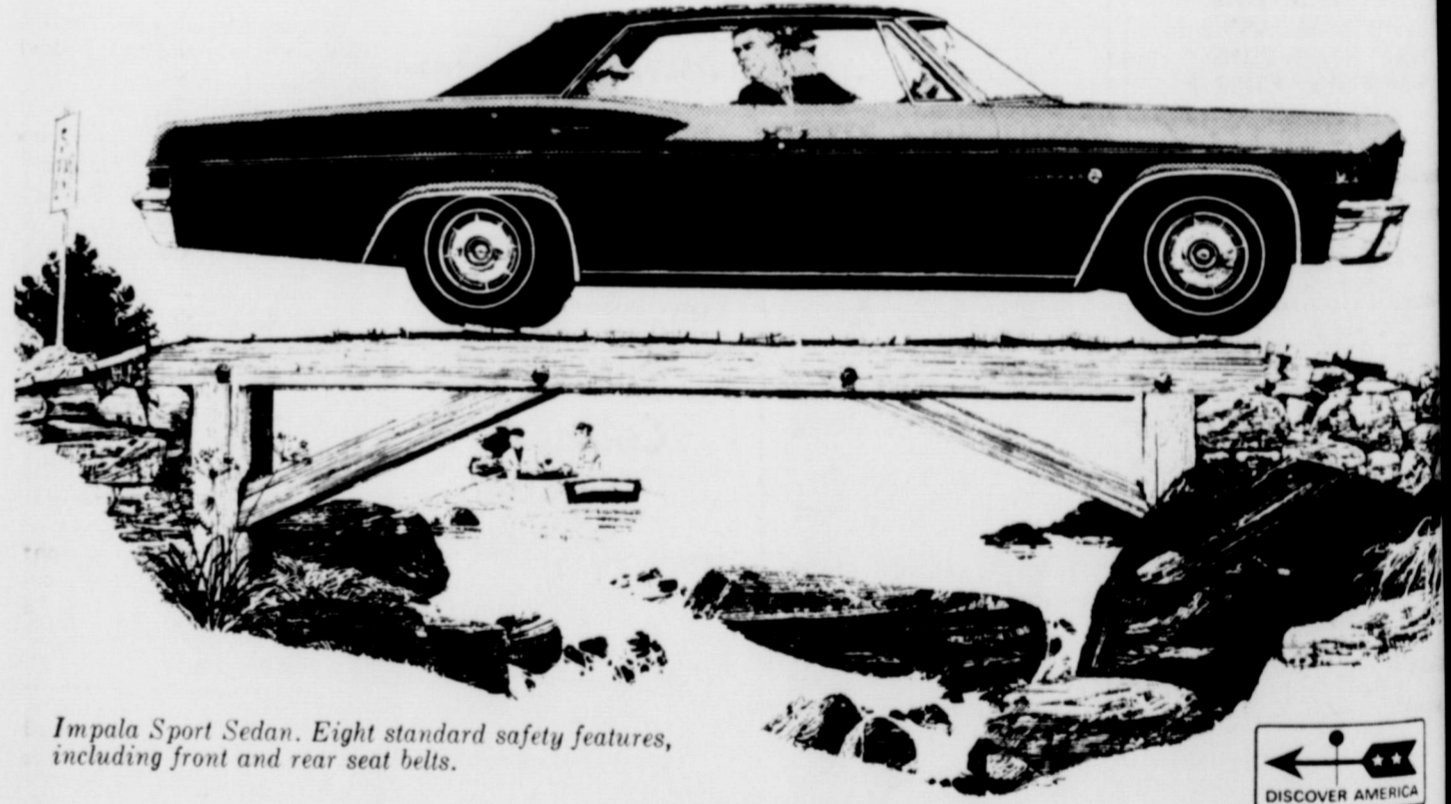
Impala Sport Sedan. Eight standard safety features, including front and rear seat belts.

CHEVROLET'S ALWAYS BEEN FAMOUS FOR SMOOTHING OUT ROUGH ROADS