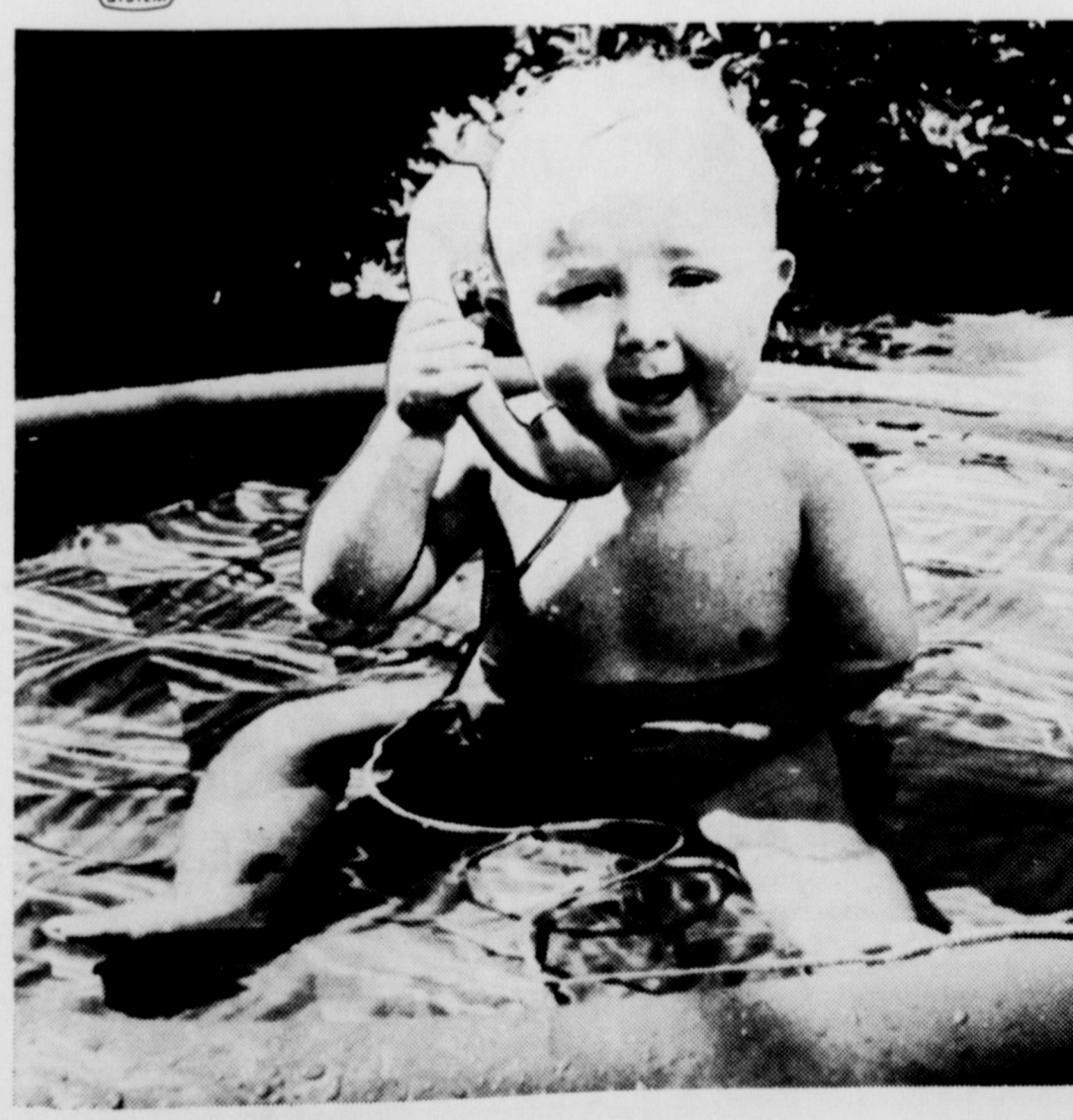
"My outdoor pleasure is never interrupted since we have an extension telephone nearby."