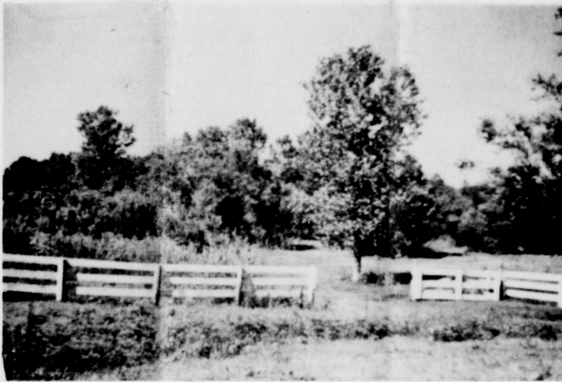
Top Picture shows the ranch on August 1961, before the cleanup began. Bottom shows the same spot just one month later after cleanup.