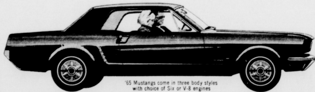
'65 Mustangs come in three body styles with choice of six or V-8 engines

VANPOOL-BURTON invites you to trigger Mustang's new "Six Shooter" engine!