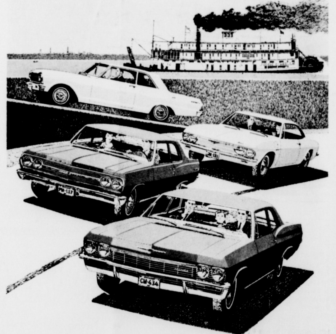
Top to bottom: Chevy II 100, Corvair 500, Chevelle 300, Chevrolet Biscayne. All 2-door models.

Each of these beauties is the lowest priced in its line. But the ride doesn't show it. Or the interior. Or the performance. That luxurious Biscayne is as roomy as many expensive cars, has color-keyed interiors, plush vinyls, fine fabrics, full deep-tufted carpeting. Chevelle, America's favorite intermediate-size car, has clean new styling, wide doors, roomy, tasteful interiors and Chevrolet easy-care features. Chevy II got a lot smarter for '65—but stayed sensible! Still family-size, easy to handle, economical, and the lowest priced Chevrolet you can buy.