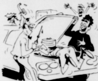
"How soon's that BLONDE coming back?"

No matter when, our FAST service will have her car ready to go!