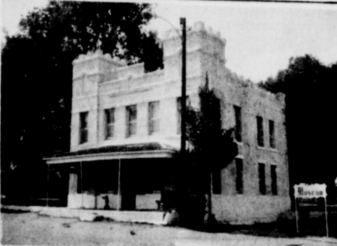
MUSEUM OPEN EACH AFTERNOON: The Wheeler County Historical Museum will be open each afternoon from 1:00 to 5:00 P.M. The museum now has approximately 300 items of historical interest on display. You are invited to visit the museum and see a bit of Wheeler County's history. The Shamrock Art Class is responsible for the painting of the sign ("Museum" at right of photo) which was erected Wednesday morning by the highway department.