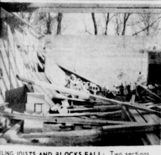
CEILING JOISTS AND BLOCKS FALL: Two sections of the roof fell on the City Offices and Fire Department meeting hall Tuesday afternoon when it was overloaded with blocks. This picture shows the back part of the building. One workman rode the scaffold to the floor and received only scratches.