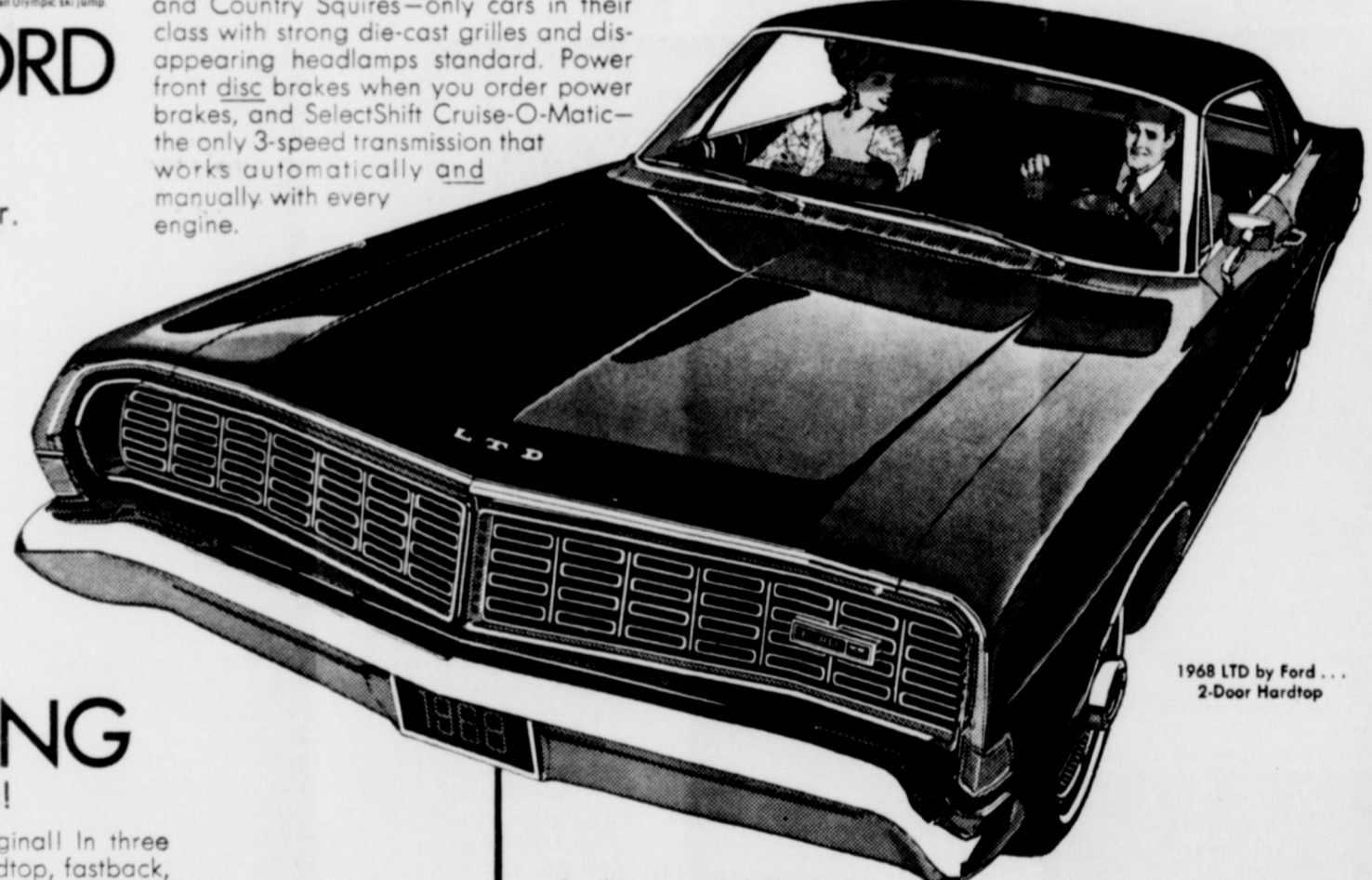
1968 LTD by Ford... 2-Door Hardtop

21 models, headed by LTD's, XL fastbacks, and Country Squires—only cars in their class with strong die-cast grilles and disappearing headlamps standard. Power front disc brakes when you order power brakes, and SelectShift Cruise-O-Matic—the only 3-speed transmission that works automatically and manually with every engine.