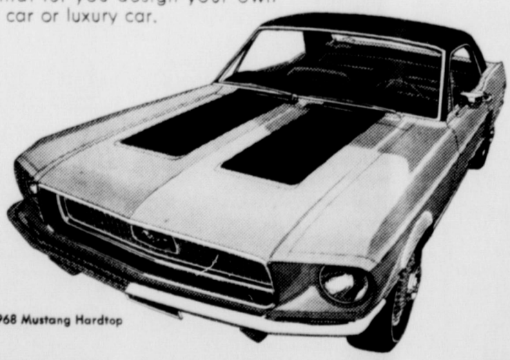
1968 Mustang Hardtop

Mustang, the great original! In three fabulous versions—hardtop, fastback, and convertible. Only Mustang gives you all these standard features: bucket seats, stick shift, new louvered hood with integral turn indicators. Plus options that let you design your own sporty car or luxury car.