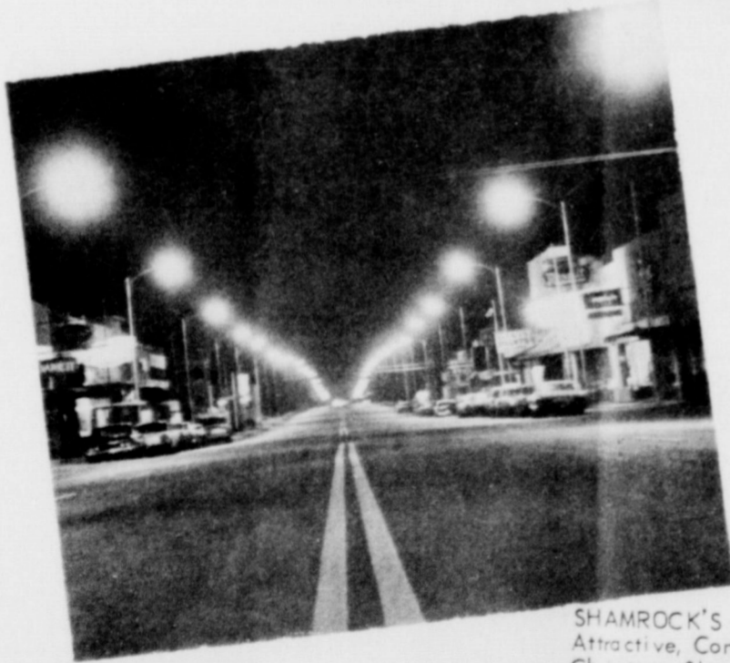
SHAMROCK'S NEW DOWNTOWN SECTION... Attractive, Convenient - Ideal For Your Christmas Shopping Tours!