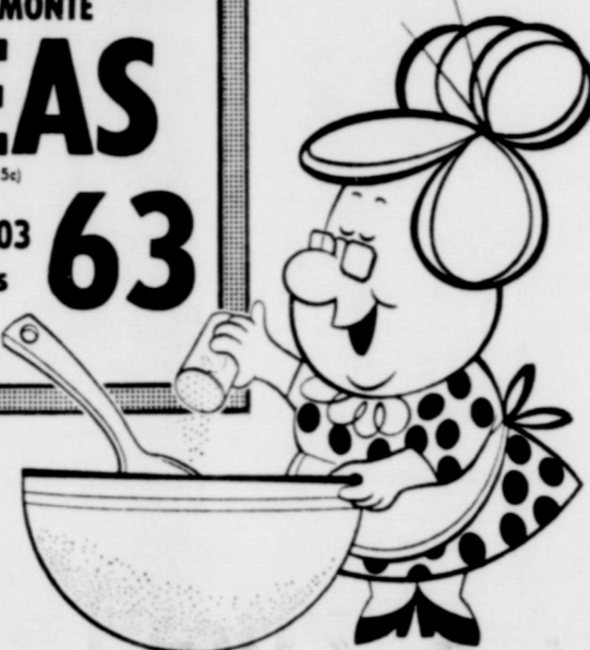
Salad Dressing Taste 3 Qt. Jars $1