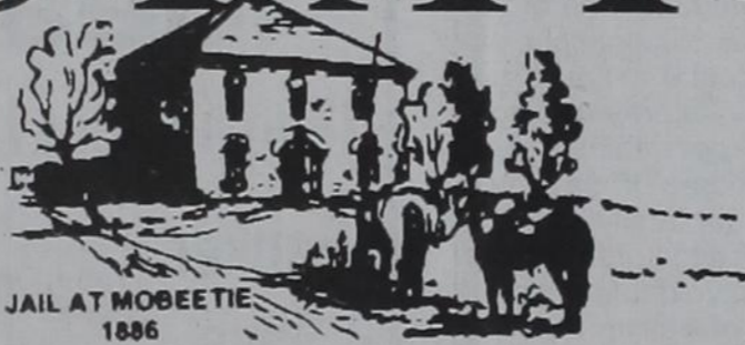
JAIL AT MOBEETIE 1886