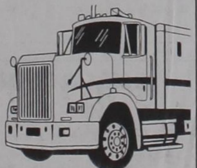
Tractor Trailer Training

Inexperienced Up To $600. Experienced Up To $1000. Pay Up To .42 cpm. Paid Training, If You Qualify. N.T.S. Placement Company 1-888-781-8556