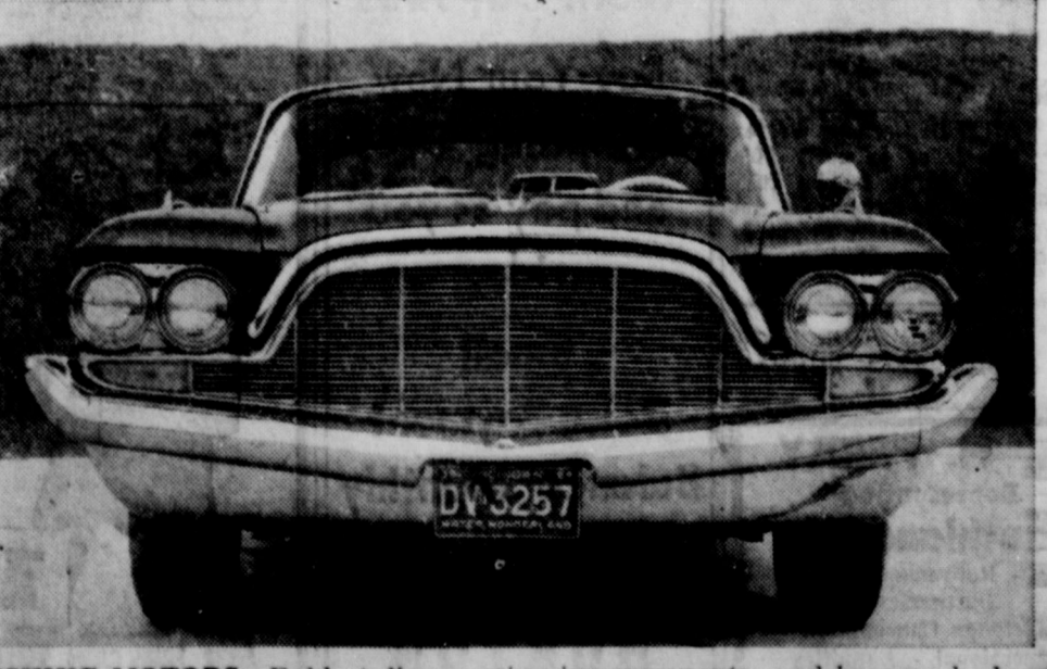
AT RUSHING MOTORS—Bold styling, engine improvements, and brawny body structure combine to bring new strength and quality to the 1960 De Soto...

SCHLAG... HER NEWS... Trace... 65... 16... .04... 1.67... 22.65... Windy and Cold