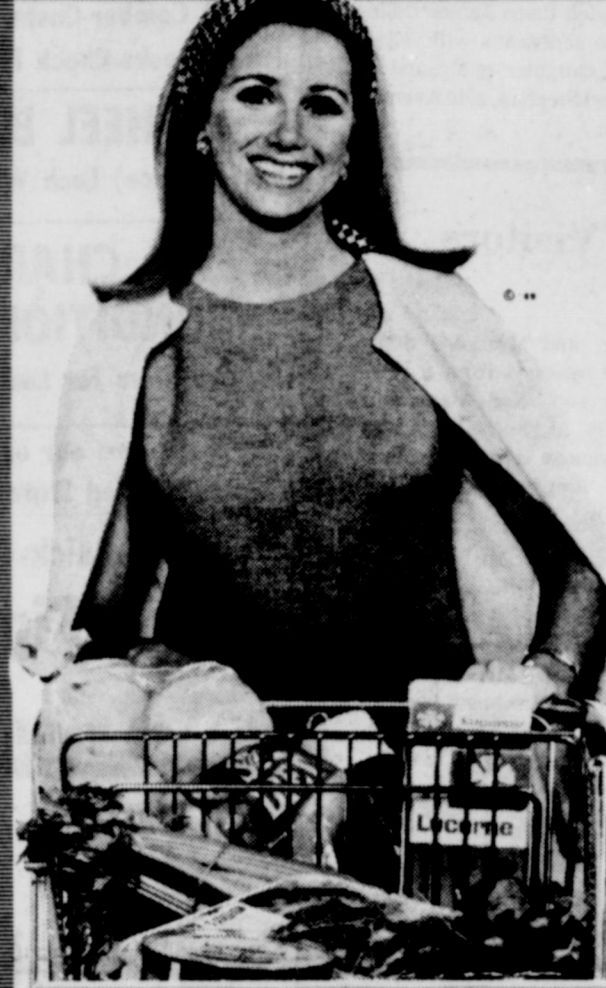
Finest Quality Meats!