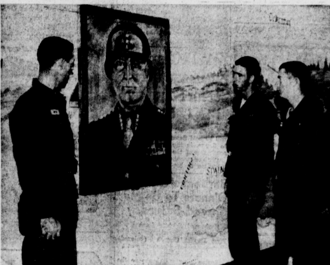
PATTON BROTHERS—Three privates named Patton admire a huge painting of Gen. George C. Patton in the 2d Armored Division museum at Fort Hood, Tex.