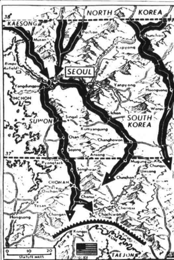
U. S. TROOPS WITHDRAW BEFORE RED OFFENSIVE—Black arrows show the routes of North Korean invasion forces which are driving U. S. and South Korean forces back to the Kum River, last major defense line (jagged line) before Taejon, South Korean provincial capital. Unofficial reports had the main Red drive in the Chochiwon-Chongpan area.

WASHINGTON, July 12.—Secretary of State Acheson said today that he would welcome offers of troops from other nations, aside from Communist China, had proposed sending in ground forces.