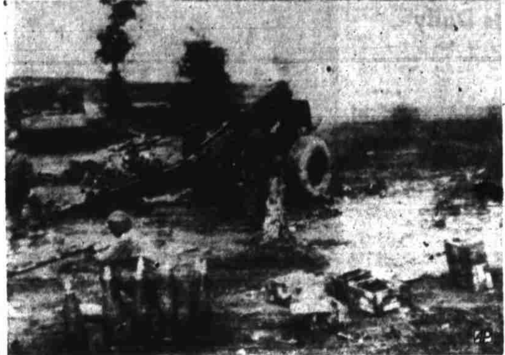
HOWITZER GOES INTO ACTION — A 155-mm howitzer goes into action against North Korea invaders. Ammunition (foreground) is ready for use and more is loaded in supply truck (left rear).

Washing coal reduces the sulfur content, making it suitable for cooking.