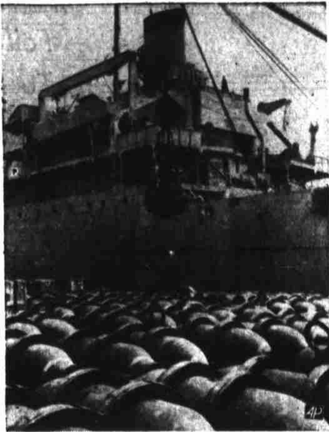
MARINE BOMBS LOADED FOR KOREA WAR—Five hundred-pound bombs (foreground) are loaded aboard the attack cargo ship Achernar in Cong Beach, Calif.