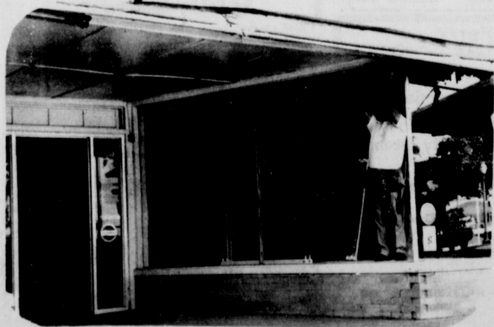
Renovation of the Chamber of Commerce building is underway. The building was formerly Kendrick Music Store and is located at 102 S. Seaman.