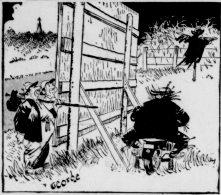
"The police are really economizing!"