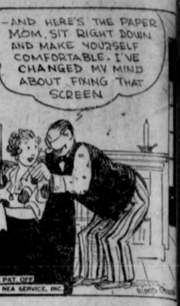
—AND HERE'S THE PAPER, MOM, SIT RIGHT DOWN AND MAKE YOURSELF COMFORTABLE. I'VE CHANGED MY MIND ABOUT FIXING THAT SCREEN