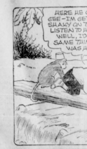
HERE HE COMES—SEE—I'M GETTIN' KINDA SHAKY ON THIS LOG—LISTEN TO HIM AOLLER! WELL, I'D DO THE SAME THING IF I WAS HIM!!