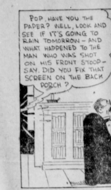
POP, HAVE YOU THE PAPER? WELL, LOOK AND SEE IF IT'S GOING TO RAIN TOMORROW—AND WHAT HAPPENED TO THE MAN WHO WAS SHOT ON HIS FRONT STOOP—SAY, DID YOU FIX THAT SCREEN ON THE BACK PORCH?