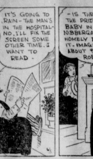
IT'S GOING TO RAIN—THE MAN'S IN THE HOSPITAL—NO, I'LL FIX THE SCREEN SOME OTHER TIME, I WANT TO READ—