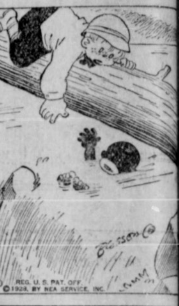
AWAHO AWAHO AWAHO