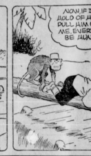
AWAHO AWAHO AWAHO