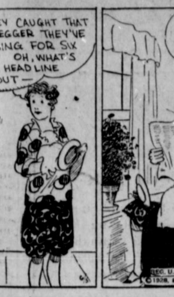
HAVEN'T THEY CAUGHT THAT BIG BOOTLEGGER THEY'VE BEEN CHASING FOR SIX MONTHS? OH, WHAT'S THAT BIG HEADLINE ABOUT—