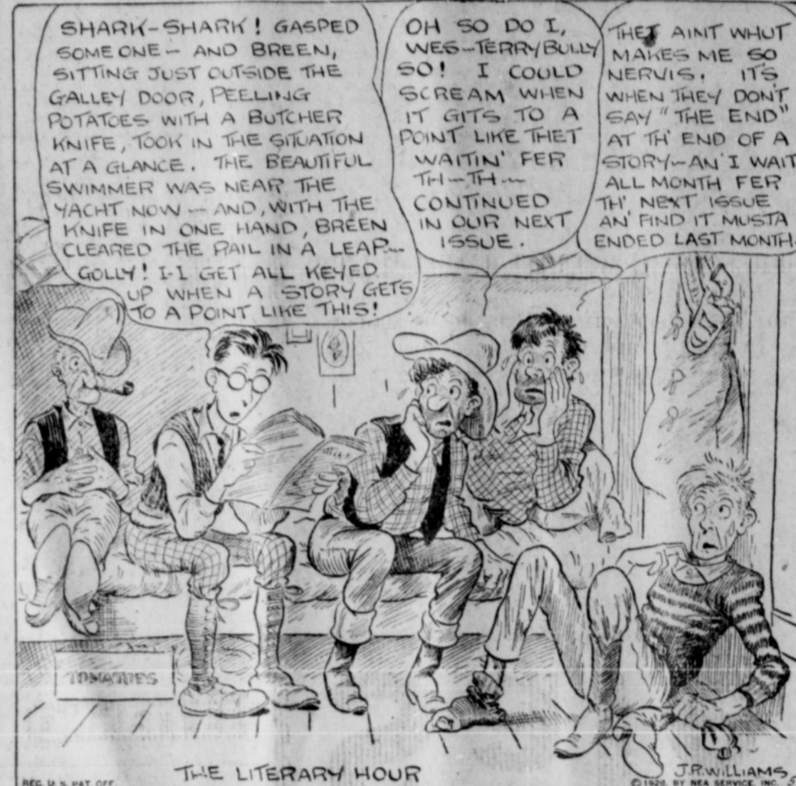
THE LITERARY HOUR