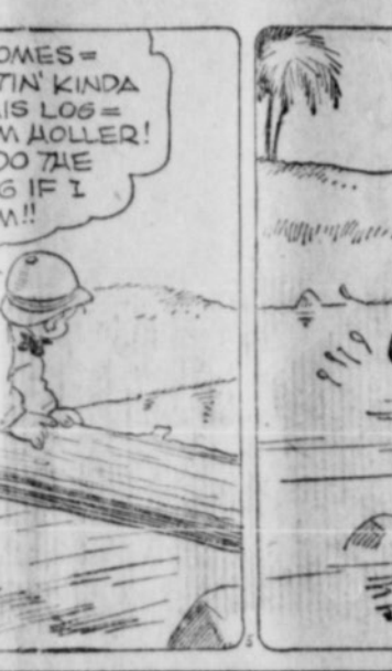
AWAHO AWAHO AWAHO