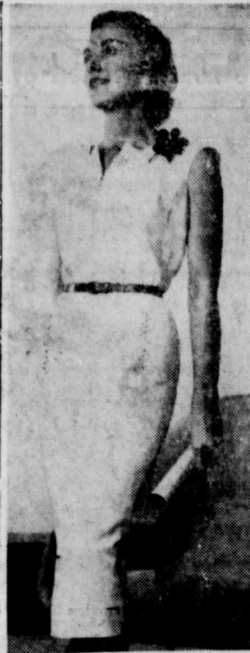
Cherries a la mode become the order of the day on this flashing white bird's eye pique by Leighton of Dallas. More red is seen laced with rhinestones on the stand-out pockets and as a leather belt. Sleeveless and with a petal neckline, the sheath cuts a slender pattern.