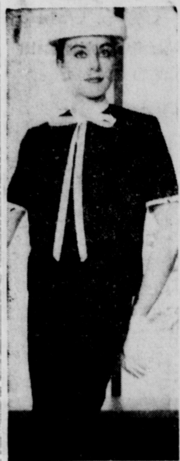
Ideally suited to the sunny days of spring is this sheath and jacket by L. & L. of Dallas. The rayon and acetate fabric is coolly perforated. A loose jacket, accentuated by white pique cuffs at its short sleeves and on the neck, ends just at the hipline.