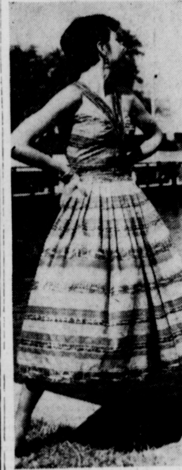
Cotton comes on material in this fine pima print dress by Brogan & Jennings of Dallas. The softly manipulated halter is bared to the sun. A deep fabric V is superimposed over the bodice. Tiny pleats gathered at the waist cause the skirt to fall in a wide circle.