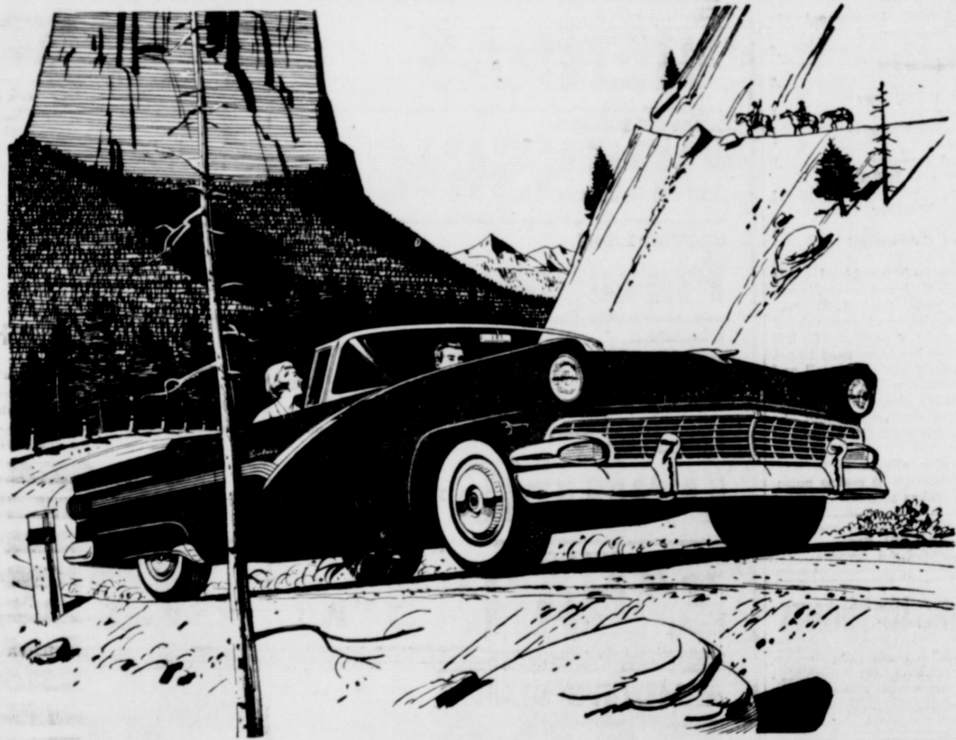
In looks, too, Ford's out front—with styling that only the Thunderbird could inspire