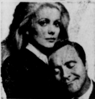
Jack Lemmon and Catherine Deneuve are "The April Fools"

Technicolor A Cinema Center Films Presentation. A National General Pictures Release.