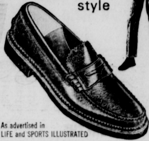
As advertised in LIFE and SPORTS ILLUSTRATED