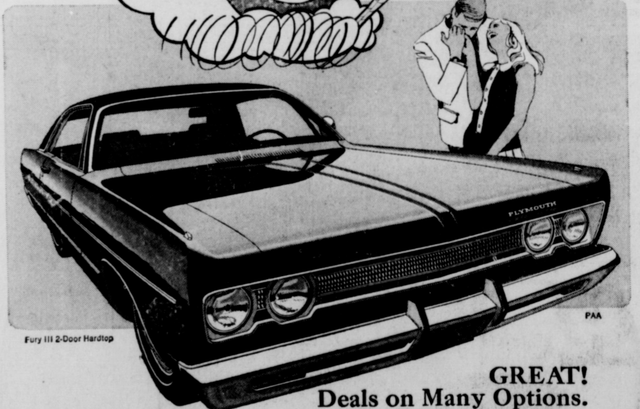
Fury III 2-Door Hardtop