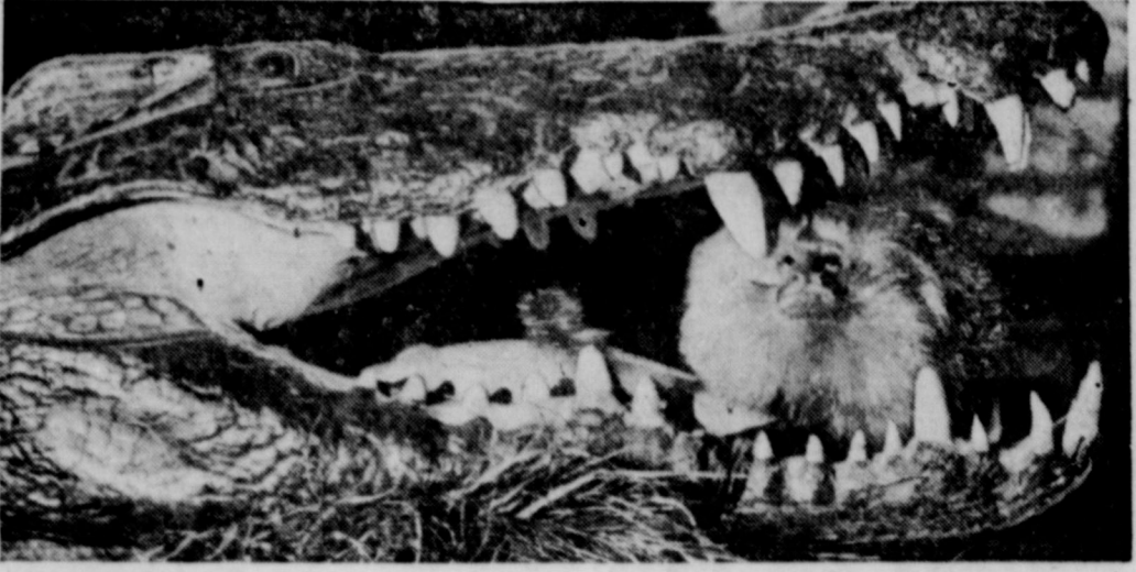
WHAT CARE IS? —"Monty," the marmoset, stares sadly inside the huge jaws of a crocodile as the inhabitant of the Paignton, England, Zoo apparently contemplates a particularly difficult method of suicide. But Monty's no fool. The reptile is stuffed.