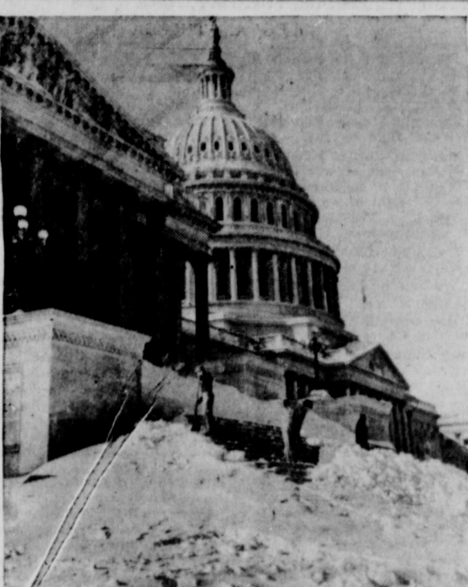
CLEANING UP WASHINGTON —The heaviest fall of snow in 22 years in Washington brought out these workers with shovels to clear the steps of the Capitol and surrounding buildings. About 14 inches of snow fell on the city as a mammoth storm crippled the East Coast.