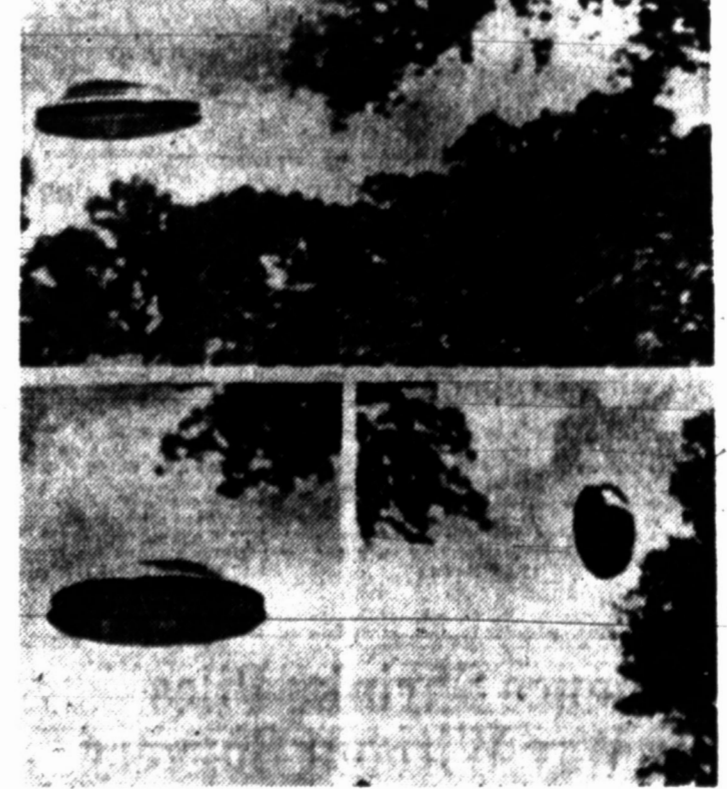
BACK AGAIN—With reports of flying saucer activity in New Mexico, the Amalgamated Flying Saucer Clubs of America, with headquarters in Los Angeles, Calif., released this series of photos taken by a member and reportedly showing a flying saucer estimated at 70 feet in diameter demonstrating low-level flight characteristics. The photographs were made June 16, 1963, near the area where new reports have originated.

If it comes from a hardware store we have it. Lewis Hdw. (Adv.)