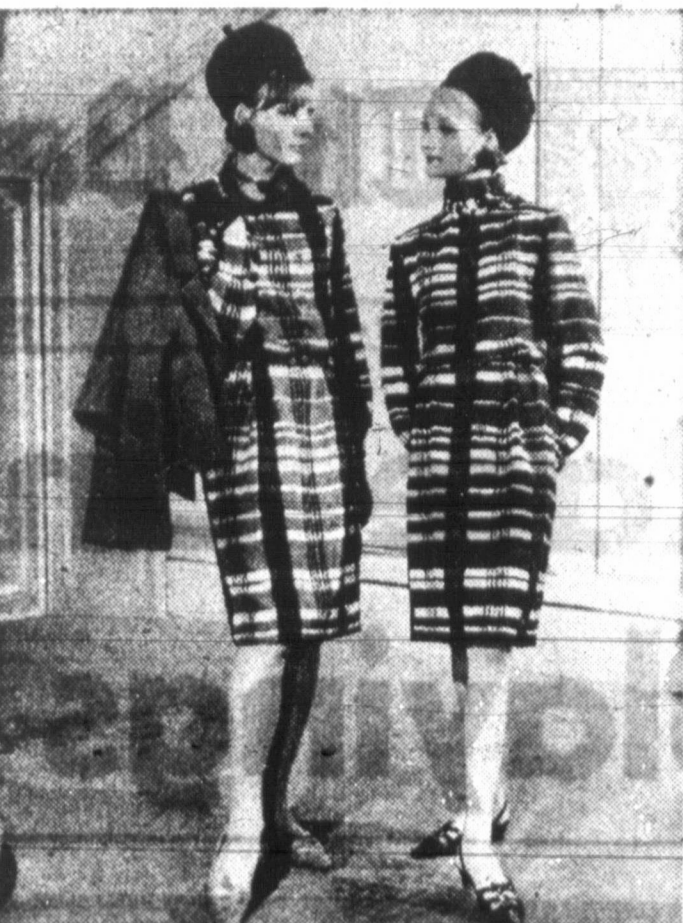
THE YOUTHFUL-LOOK is the keynote of these designs by Marc Bohan for Christian Dior. Green, white, geranium print (left) is shown with green jersey unfitted jacket. Navy, white and geranium print (left) can be worn with its own jacket in navy cheviot.

New York, N. Y. (Special) — For the first time science has found a new healing substance with the astonishing ability to shrink hemorrhoids, stop itching, and relieve pain — without surgery. In case after case, while gently relieving pain, actual reduction (shrinkage) took place. Most amazing of all—results were so thorough that sufferers made astonishing statements like "Piles have ceased to be a problem!" The secret is a new healing substance (Bio-Dyne®)—discovery of a world-famous research institute. This substance is now available in suppository or ointment form under the name Preparation M®. At all drug counters.