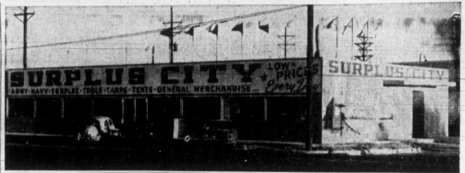
SURPLUS CITY — Located at 403 S. Cuyler, Surplus City handles merchandise ranging from complete tool supplies to glassware. A full display of sporting goods is

By JOHN PIERSON WASHINGTON (UPI) — By 1975, the average American family will be earning $9,525 a year, the average wage earner will be working 37 hours a week, and the chances are that every other person you meet in the street will be under 26 years old. These and other predictions are contained in a report, "U.S.A. and its Economic Future," prepared by the 20th Century Fund and published today by the MacMillan Co. The report predicts that total national output will reach $1 trillion by 1975. This is $400 billion more than the U.S. economy produced last year. The fund made the forecasts with only this qualification — "barring war or national disaster." It said that the U.S. population, which stood at 190 million in 1963, would rise to 235 million, by 1975, with half under 26 years old. Marriages will be running at about 2 million a year and births at more than 5 million, bringing on an even bigger "baby boom" than the one that followed World War II, according to the report. And the average worker is expected to be producing in 1975 more than half again as much as he produced in 1962. Despite this glowing outlook, the report warned that the United States must still solve major problems such as unemployment, poverty and unmet social needs.